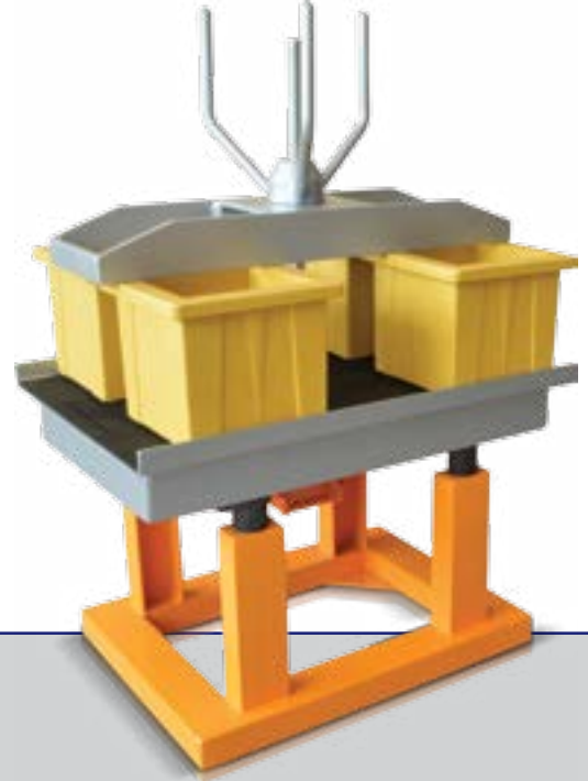
Vibrating Table (B-125)